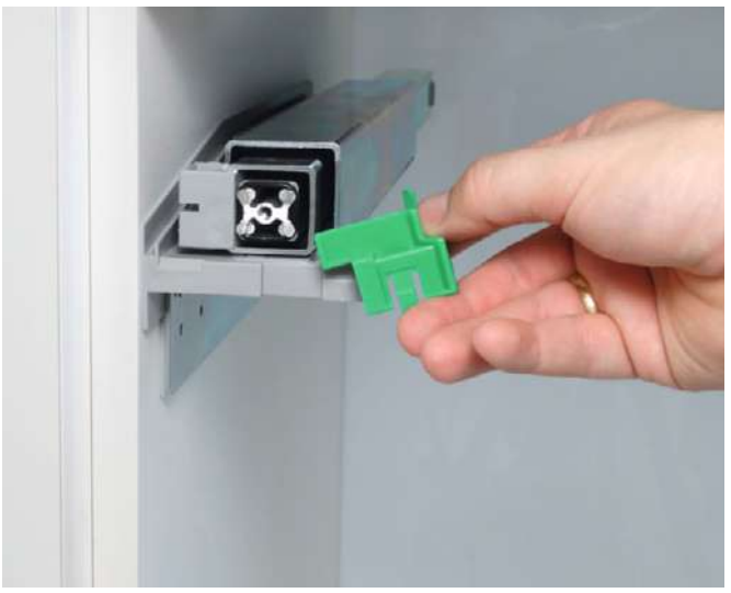
Remove transportation lock.