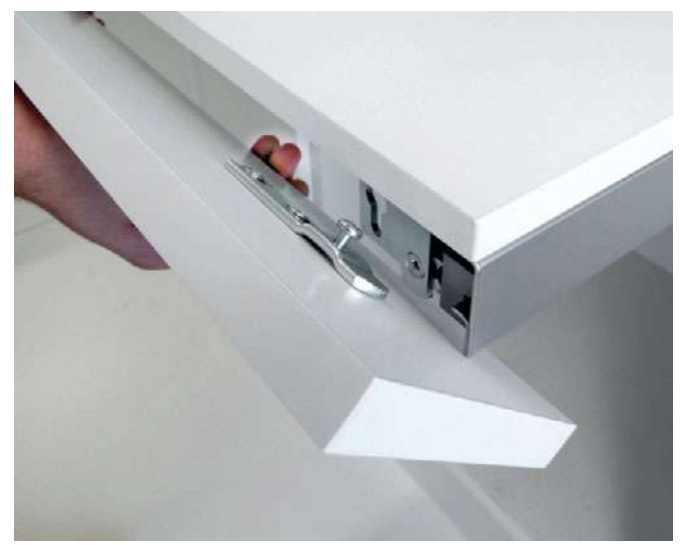
Click front into place and fix it.