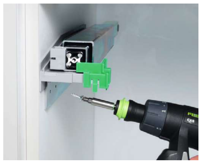
... for easy fixing.